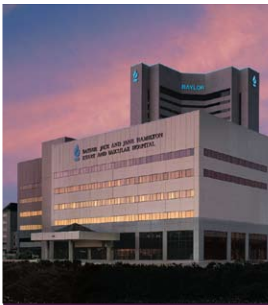
Baylor Jack and Jane Hamilton Heart and Vascular Hospital

I N JUNE, the Baylor Health Care System Foundation received a grant from an anonymous donor to sponsor a Vascular Surgery Fellow throughout the two-year course of study. This specialty deals with patients affected by the build-up of fatty deposits in arteries throughout the body, blockage of blood flow to the brain, and swelling of legs due to fluid build-up in the lymphatic vessels.