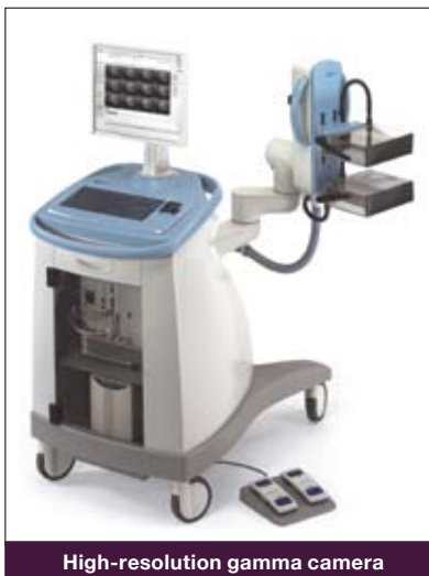
High-resolution gamma camera

Baylor will be the first imaging facility in the Southwest to